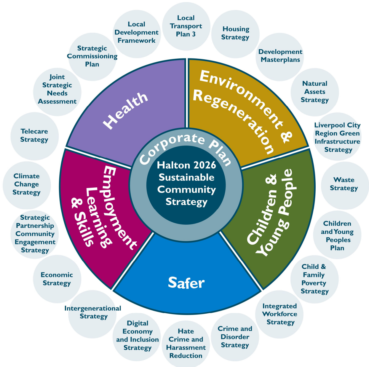
Figure 2: Integration between the priorities of the Sustainable Community Strategy with the Corporate Plan and other key plans and strategies.

The Halton Sustainable Community Strategy has been prepared in the context of other key local plans and strategies. It does not stand alone in isolation; it is an overarching high level strategy that is supported by a multitude of detailed strategies that deal with specific topics and coordinate the delivery of services and projects